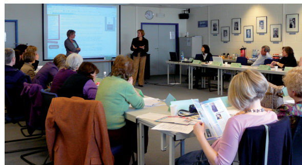
SIOPE/ICCCPO meeting: 21 delegates from 18 countries